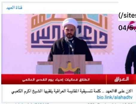
Figure 1: AAH's al-Ahd TV describes Kaabi's speech as the statement of the Tansiqiya, April 14, 2023.