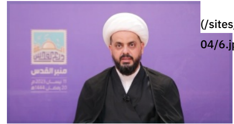
Figure 2: Qais al-Khazali delivers a recorded speech on Quds Day, April 14, 2023.