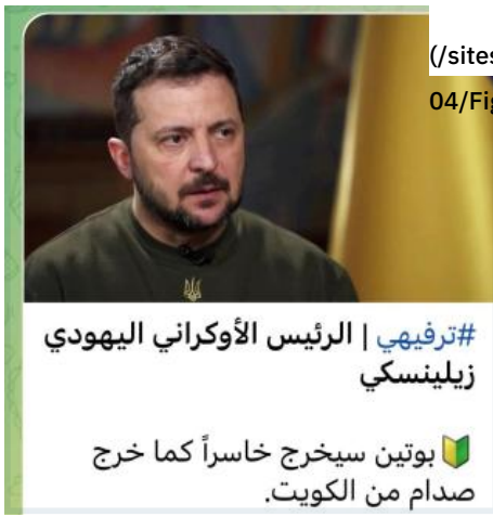
Figure 2. Tura News tries to smear Ukraine's president with anti-Semitic framing.

have completed the Hajj pilgrimage (e.g., Hadi al-Ameri and Nouri al-Maliki from the Coordination Framework, the body that oversees muqawama political factions).